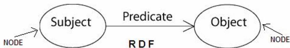
Figure 1.0 RDF Graph

The underlying structure of any expression in RDF is a triple consisting of a Subject, a Predicate and an Object. A set of such triples is called an RDF graph. Figure 1 shows a node and directed-arc diagram of a single triple.