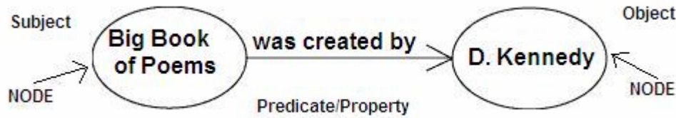
Figure 2.0 Sample RDF Graph

Subject nodes and predicates must be URIs. An object node may be a URI reference, a literal, or blank (having no separate form of object identification itself).